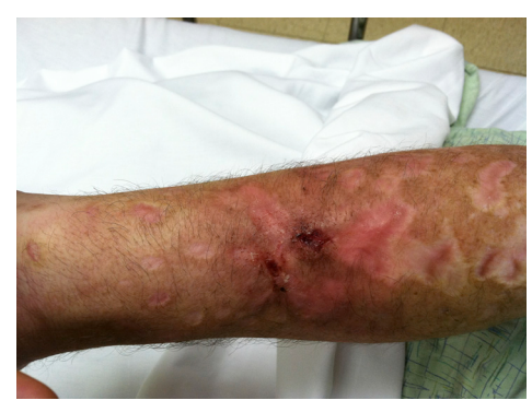
Fig 3. Skin popping scars. Multiple irregular, circular, hypopigmented scars on back of forearm. Central area of hemorrhagic crusting from recent injection.

infections because IDUs sometimes "clean" their needle or skin with their saliva before injection. 12,54,55 Drug dealers have been known to hide drug containers in their mouths during police raids, which was speculated to be the source of an outbreak of a clonal strain of Streptococcus pyogenes in Switzerland.<sup>56</sup>